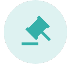
Death Penalty Reform