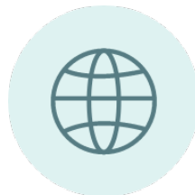
Universal Broadband Access