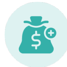
Payday/Title Lending Reform