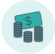
Adequate State Budgets