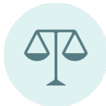
Criminal Justice Reform